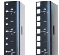
Mounting Rails / Angles