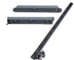
Power Bars – Horizontal & Vertical