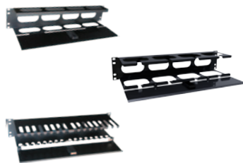
Horizontal Cable Management