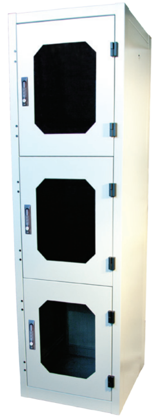
3-Compartment CoLocation Cabinet