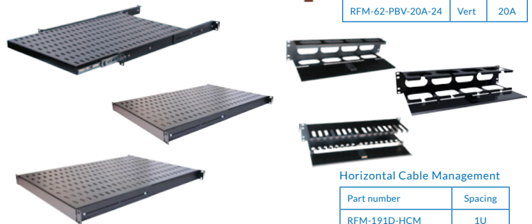
Adj. Mount Depth - Fixed Position