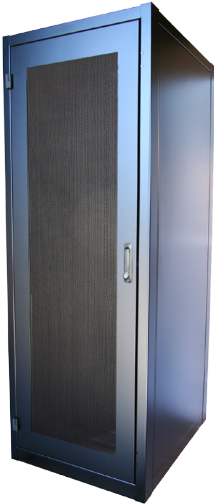
30" wide cabinet – RFM-303683-US-19-S

R. F. Mote Series Seismic Zone 4 Kitted Cabinets (30" and 24" Wide) are independently certified to meet UBC code seismic strength requirements for Zone 4 as per Bellcore GR-63-CORE specifications. Standard kitted Seismic cabinets include: 2 Perforated doors, 2 solid side panels, 2 pair cage-nut style mounting rails, levelling feet, removable top cover panel, and hardware package.