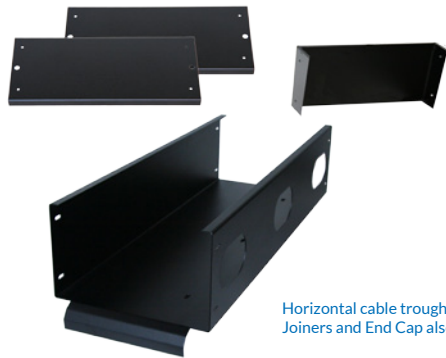
Horizontal cable trough - high density: 8" width. Joiners and End Cap also shown