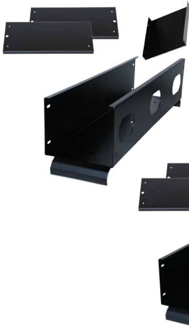
Horizontal cable trough: 5" width. Joiners and End Cap also shown.